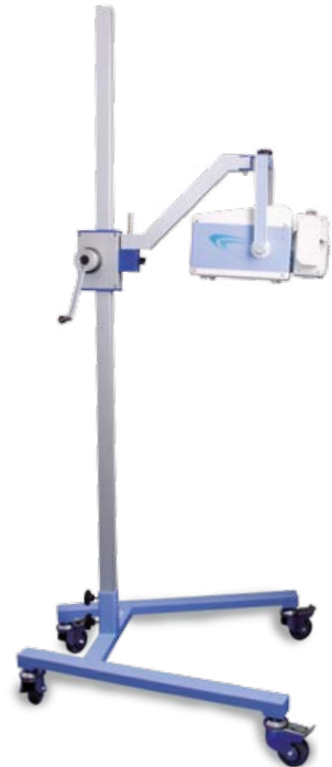
PXMS - 1800 Mobile Stand